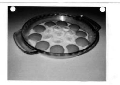
How to make banana pudding